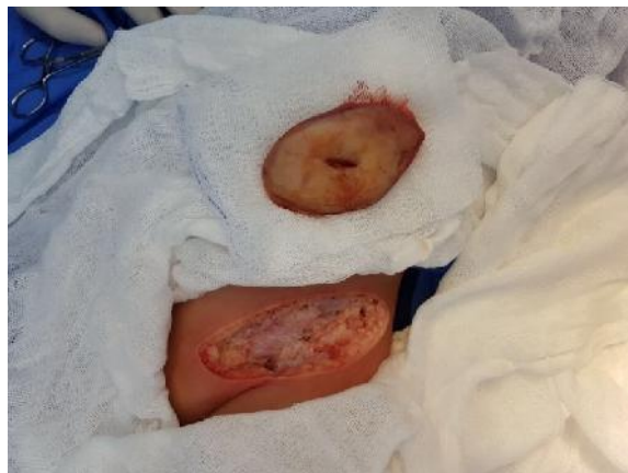
Fig.3 Complete surgical resection of the lesion at the level of the left iliac fossa.