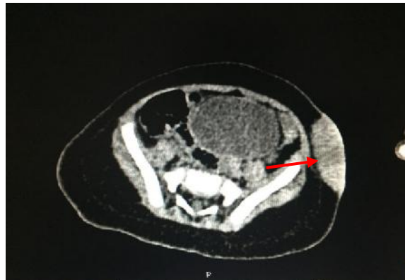
Fig.2 Tomography image in axial section in simple phase where an ovoid image of 4.8 x 3 x 1.6 cm is observed, dependent on skin and with infiltration to subcutaneous cellular tissue.

lymphnodes suspected of infiltration; Complete surgical resection is performed (Figure 3) as well as a biopsy which reports a lymphoid neoplastic lesion involving the superficial and deep dermis as well as subcutaneous cellular tissue composed of small and medium lymphocytes, with scarce cytoplasm and oval nucleus with lumpychromatin, atypical mitosis and necrotic center., the report of immunohistochemistry (CD20 +, MUM1 +, BCL2+, CD43+, CD130+FOCAL, LAMBDA + FOCAL, KI67 +,Diffuse Non-Hodgkin Lymphoma of Large Cells B withdefinitivereportisperformedbonemarrowaspiratew hichisreportedwith B-cell NHL infiltration (Figures 4 and 5); it was decided to start treatment with chemotherapy LMB 96 protocol after completing treatment, AMO and PL control were carried out, which are reported without infiltration data initiating their surveillance.