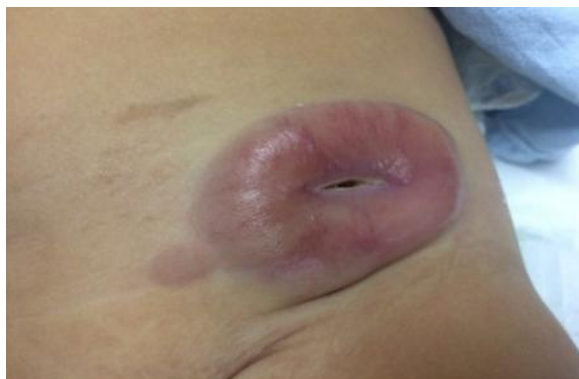
Fig.1 Image at the abdominal level showing the lesion with edges defined umbilicated violaceous appearance by taking a biopsy of approximately 5 x 3 x 2 cm.

Female breastfeeding patient who has a maternal grandmother with lymphoma under surveillance; they live in the countryside, they cook with firewood; He began his illness 6 weeks before admission to this hospital, with the appearance of a nodule in the left inguinal region of a reddish color of approximately 2 x 1 cm. He was treated as an infectious process first because he had a difficult control fever, but he did not respond to antimicrobial treatment, increasing in size, reason for which ultrasound is performed, which reports "granuloma" and a biopsy is decided which reports probable small cell lymphoma; being referred to this hospital.