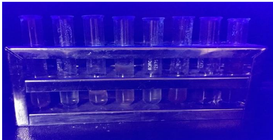
Figure 3: Fluorescence analysis of Pungampoo Chooranam Observation under Long UV light (365 nm)