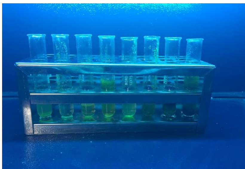
Figure 2: Fluorescence analysis of Pungampoo Chooranam Observation under Short UV light