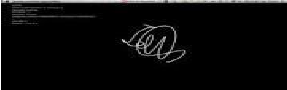
Figure2 Gray image

red, green and blue in it. If each of these components has a range 0–255, this gives a total of 256^3 different possible colours. Such an image is a “stack” of three matrices; representing the red, green and blue values for each pixel. This means that for every pixel there correspond 3 values, whereas in greyscale each pixel is a shade of gray, normally from 0 (black) to 255 (white). This range means that each pixel can be represented by eight bits, or exactly one byte. Other greyscale ranges are used, but generally they are a power of 2, so, we can say gray image takes less space in memory in comparison to RGB images.