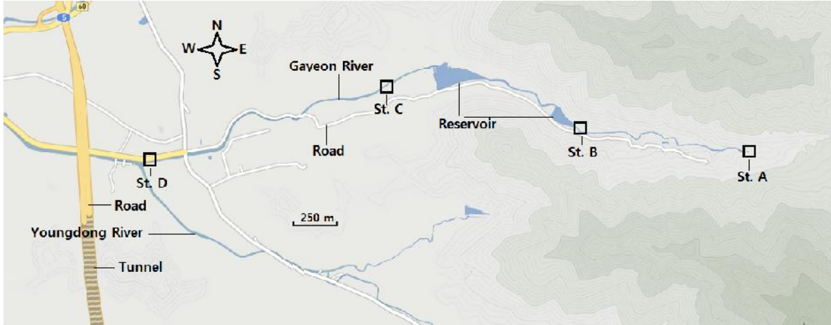
Figure 1: The four stations at the Gayeon River, Haman-gun, Korea.