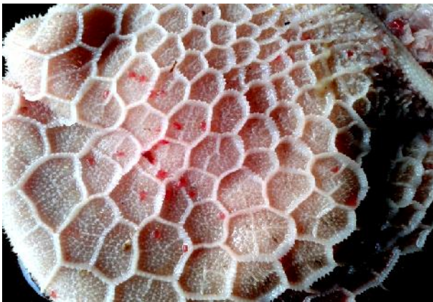
Fig. 3 Note few amphistomes in reticulum

Fig. 1 & 2 Note numerous pink amphistomes attached to ruminal papillae