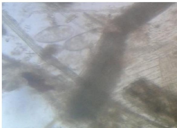
Fig. 4 Note presence of operculated eggs in faecal sample