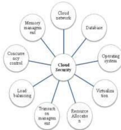
Fig. 2 Components affecting Cloud Security

Concurrency control involves encrypting the data as well as ensuring that appropriate policies are enforced for data sharing. Resource allocation and memory management algorithms have to be secure. Finally, data mining techniques may be applicable to malware detection in clouds.