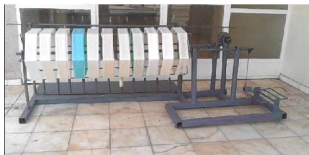
Figure 4. Fabricated manual hank reeling machine

produced hank yarn is distributed uniformly throughout the width of hank.