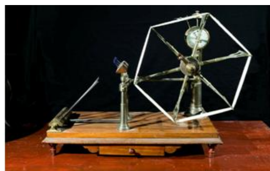
Figure 2. Electrical and Hand driven Hank reeling machines