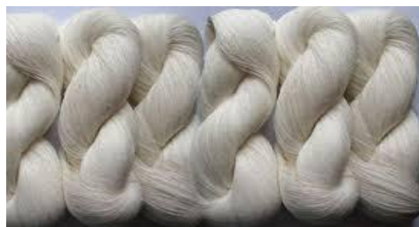
Figure 1. Hank yarn

Hank reeling machine is used to change cone or cop packed yarn into a hank form by winding a yarn into a circular or round shaped reel. Hank yarn used to produce knitted and woven fabric [3-4].