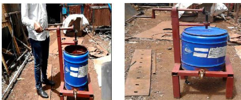
Figure 2. Fabricated Manual Textile chemical mixing and processing machine

As indicated in Figure 2, the fabricated manual Textile Chemical processing machine can mix chemical solution by rotating machine handle by hand. The machine can mix the solution uniformly. After