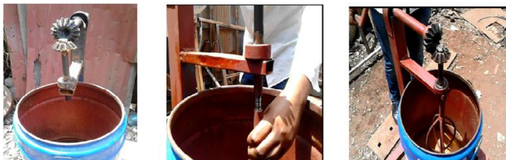
Figure 3. Engaging and removing chemical mixer part.

As indicated in Figure 3, the mixer part has a bolt and can be engaged to the main shaft. The main shaft has a hollow teeth used for fixing of Mixer part. When Machine handle rotates, the mixing part can mix chemical solution.