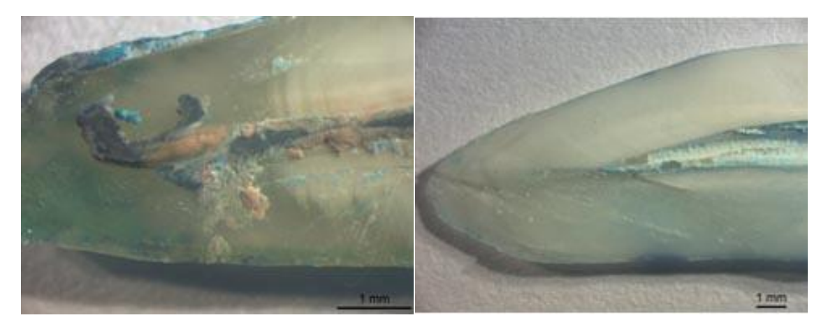
Fig. 1. Thermafil obturation

Coronally 2mm of gutta-percha was removed from the canal and cervically sealed with Glass Ionomer Cement. All the specimens were placed in incubator for 48hrs at 37°C and 100% humidity for thermocycling. After thermocycling procedure, root surfaces of all the specimens were coated with three coats of GC Fuji Varnish (GC, Tokyo) leaving the apical 2mm and specimens were immersed in methylene blue dye for 48 hrs at 37°C. Specimens were washed with water and dried. Longitudinal sections were then prepared using sectioning disc and are examined under stereomicroscope to determine apical microleakage. Stereomicroscopic evaluation was done with a Wild Heerbrugg stereomicroscope under 6.5X magnification surface using Leica application software to determine the presence or absence of dye.