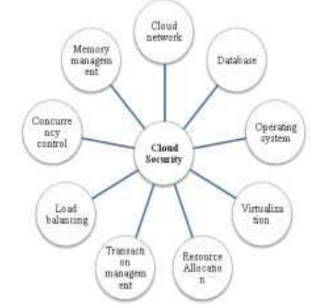
Fig. 2 Components affecting Cloud Security

Concurrency control involves encrypting the data as well as ensuring that appropriate policies are enforced for data sharing. Resource allocation and memory management algorithms have to be secure. Finally, data mining techniques may be applicable to malware detection in clouds.