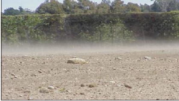
Fig: 2 Saltation in a cultivated field with 20 km/hr winds ET: LM: SL20: June 2002