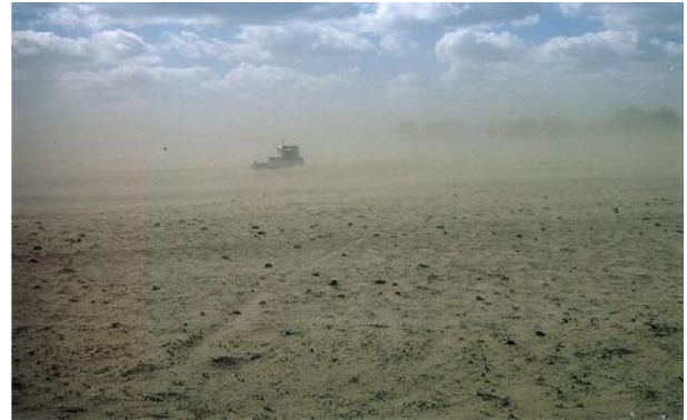
Figure:1 Fine soil particles in suspension

enriched in such constituents compared with the bulk soil source. About 3-38% of the eroding soil could be carried in suspension, depending on soil texture (Van Seville, 2020).