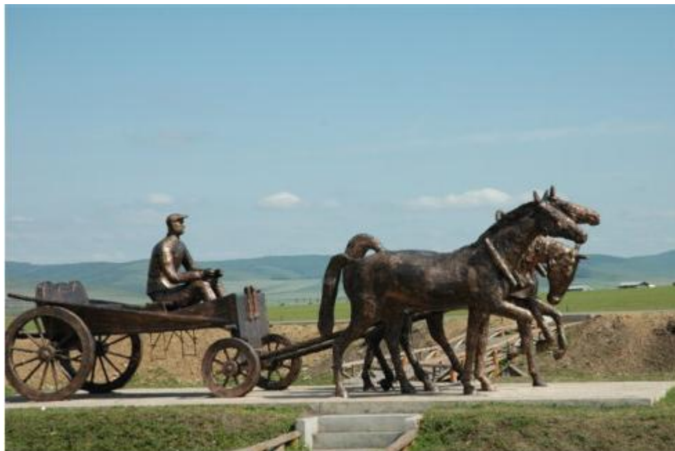
Three carriages rushed to Datong

As a step in the motto, science is constantly waking up.